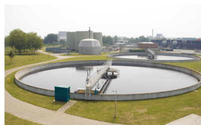
Waste water treatment