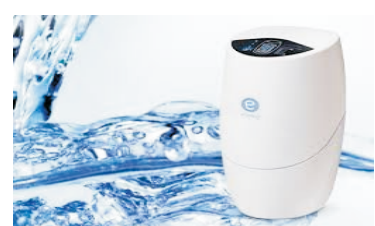
Alkaline water generator