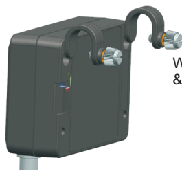
Wall mount hanger & nylon screw x 2

Wall mount hook to fix monitor and pH probe to water tank