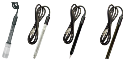
Low ionic 86P4